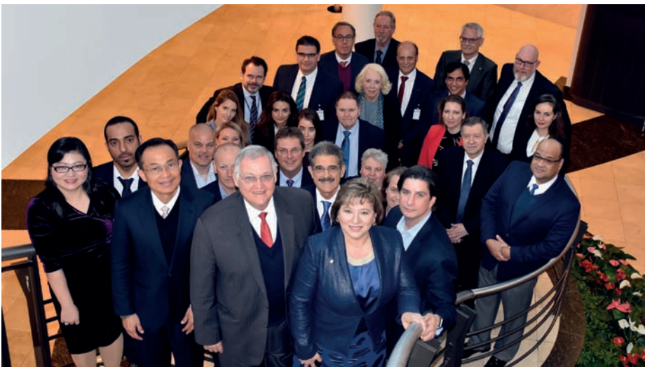
CAI delegates, pictured at the CAI meeting in Cape Town, already looking forward to participating in the 5th WCO Global AEO Conference.

The WCO is working extensively on finalising its E-Commerce Package, which contains the Framework of Stand-